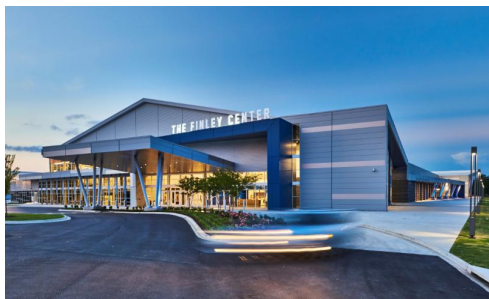
2018 Building of the Year - Hoover Sportsplex Dunn Building Company Birmingham, AL

ceremony will take place during the opening session where we'll be joined by MBMA members so plan now to attend this prestigious event. Submit your projects by February 15, 2019. New this year is a Reroof/Renovation/Addition Category by your request!